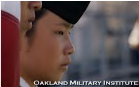
OAKLAND MILITARY INSTITUTE

of meeting the academic requirements for any university in the nation and who are prepared for their roles as future leaders." OMI alumni have been recruited to preeminent institutions of higher learning including the U.S. Military Academy at West Point.